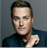
MICHAEL W. SMITH